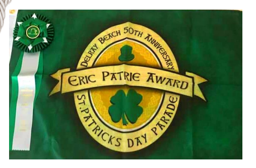
First Place Marching Unit